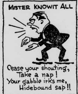
FOR THE RABID ANTI NEW-DEALERS FROM THE NEW-DEALERS