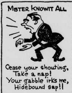
FOR THE RABID NEW-DEALERS FROM THE ANTI NEW-DEALERS