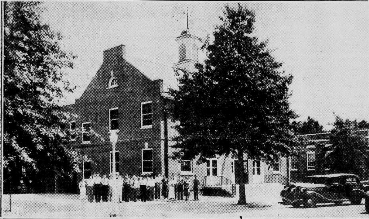
ABOVE picture shows High School "city officials" in front of the Fire Dept. of the new Municipal Building. In the right background is the new Post Office Building.