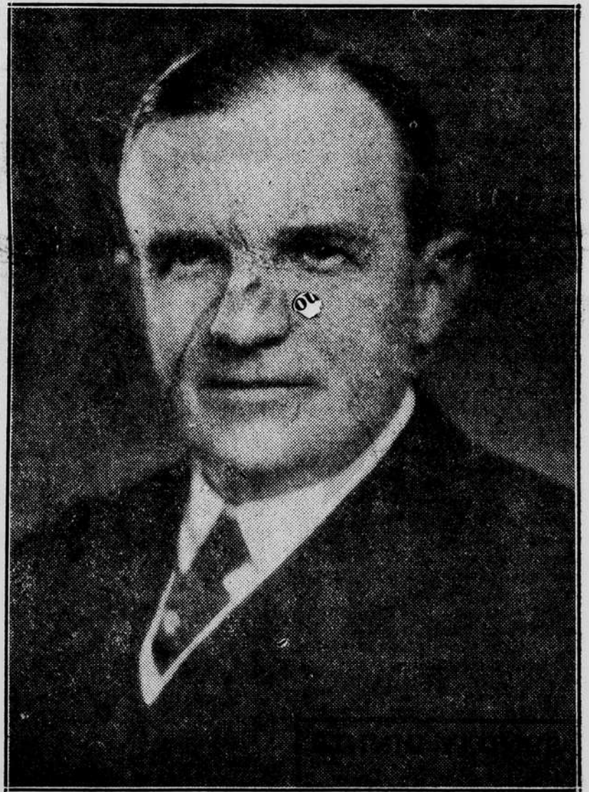
Congressman John H. Kerr