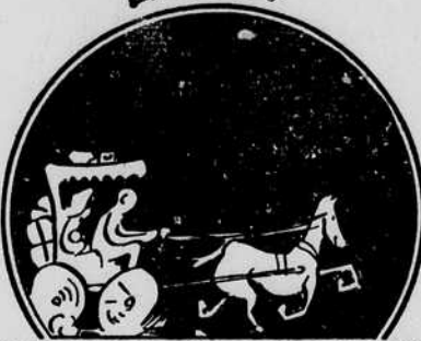
BETWEEN 1790 AND 1815 APP. 200,000 TARHEELS MOVED OUT OF THE STATE