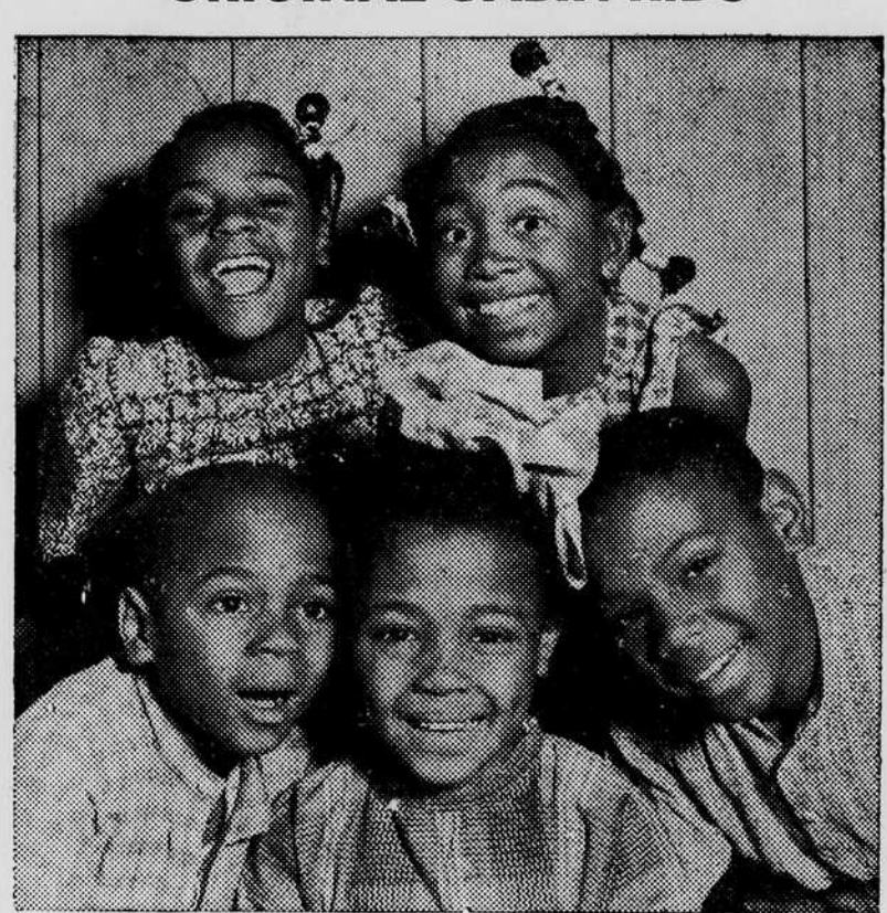
Coming to Peoples Theatre here on Tuesday, March 2nd