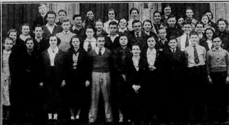
The 10-1A section of the tenth grade at the Roanoke Rapids High School. These young High School students had their pictures taken just before school was out the first of the month.