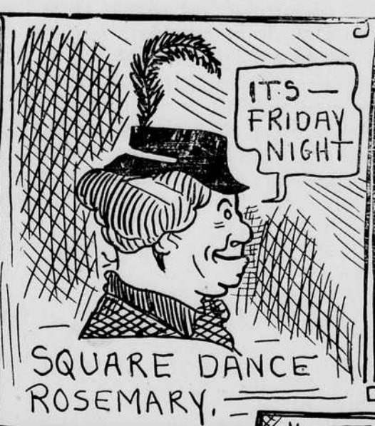
SQUARE DANCE ROSEMARY.