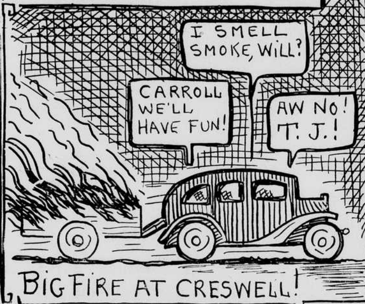
BIG FIRE AT CRESWELL!