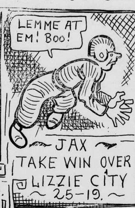
JAX TAKE WIN OVER LIZZIE CITY ~ 25-19.