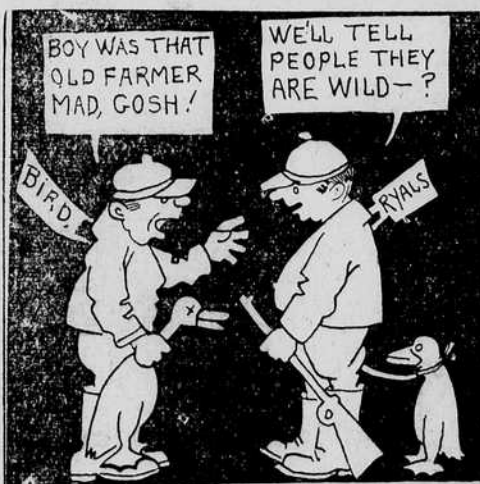
RUSSELL BIRDSONG AND BAB RYALS KILL 20 GEESE IN HYDE COUNTY.