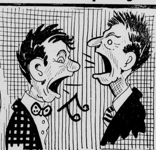
"KIWANIS STAGE ANNUAL COMMUNITY SING" SUNDAY!