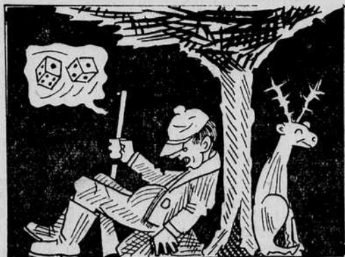
ROANOKE-PATTERSON STAGE THEIR ANNUAL DEER HUNT!!