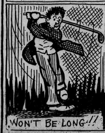
WON'T BE LONG!!