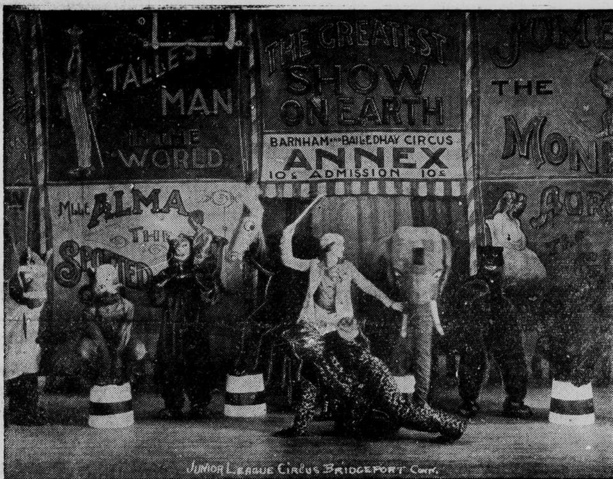
JUNIOR LEAGUE CIRCUS BRIDGEPORT Conn.

"Sawdust And Spangles", Circus-Minstrel-Revue, To Be Staged Here Thursday And Friday Nights, March 16 and 17