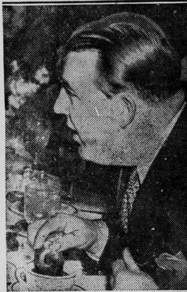
Winner by a nose, Representative Jennings Randolph, of West Virginia, is seen on the last lap, romping home far ahead of the field in the dunking marathon staged by members of House in Washington