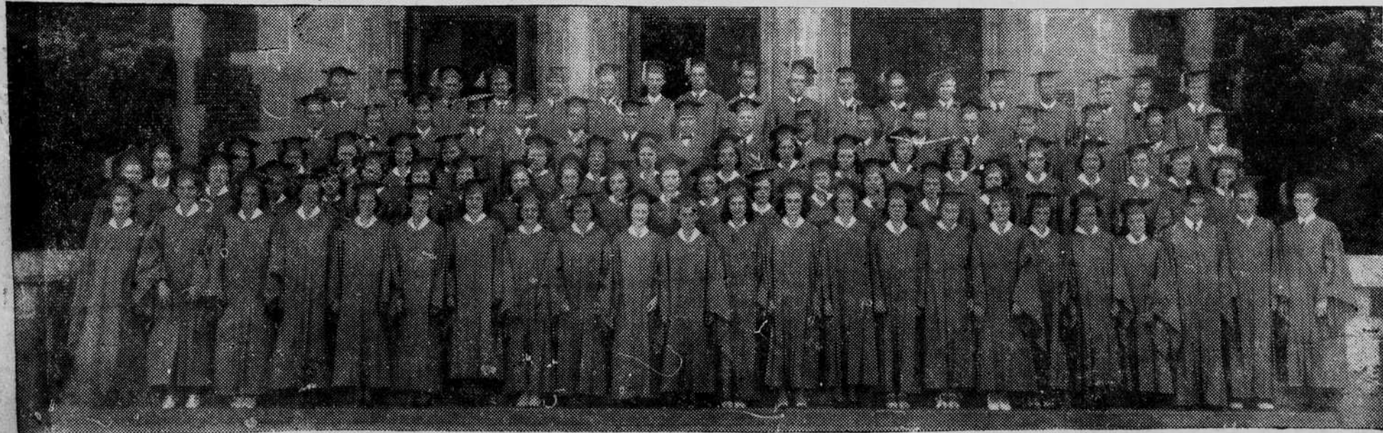
HERE they are, 94 of them, the 1939 class of Roanoke Rapids High School, largest class ever to graduate from the local High School. Last Thursday night closed a week of exercises, parties, awards and celebrations (mixed with tears) as this fine group finished Roanoke Rapids High School and commenced to plan for a new life. Roanoke Rapids is very proud of this fine.. its largest class. A salute to 1939.