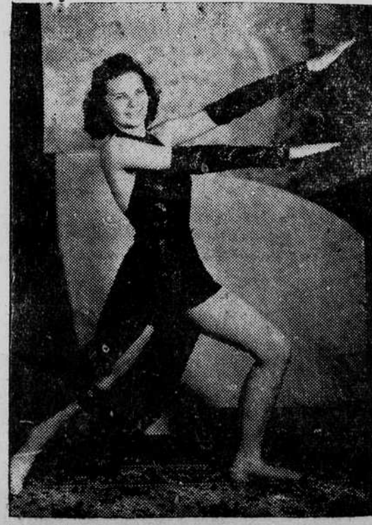
MISS KIDD