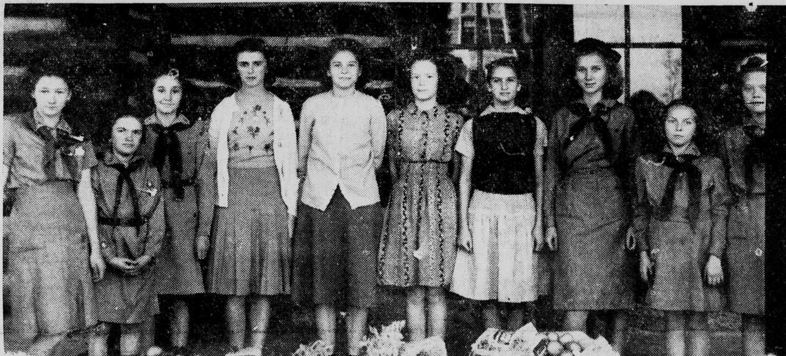
Part of the group of Roanoke Rapids Girl Scouts with their Thanksgiving baskets which they prepared and delivered to needy families in the city for today's meals. This is one of the many phases of work done by the Girl Scouts during the year. The local Girl Scout organization is partially supported in this fine work by the Roanoke Rapids Community Chest and your Chest donations help them to continue and increase their activity program. N.Y.A. officials will dedicate the Girls Scout Hut here December 7.