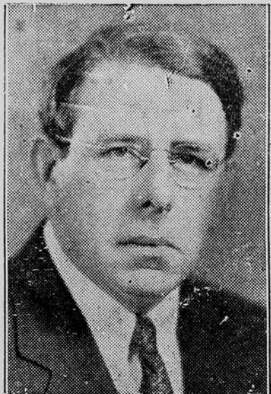
Prominent Raleigh attorney and Sunday School leader, who Tuesday announced his candidacy for the Democratic nomination for Governor.