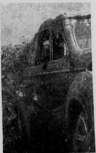
The above photograph, snapped by the newspaper, shows the car of David Willis of the bridge over the big canal which passed through the radiator, and over the seat through the window of the crash, was uninjured, except for the front end. It is reported that he told investigators that he was traveling about 60 miles an hour when the crash occurred.

Only $475.60 is the estimate amount of damage suffered by city of Roanoke Rapids from 43 fires within the city limits during the year 1939. It is believed by firemen that this is an all-time record for damages, since the department was established in 1908. The firemen answered 43 calls within the city during the year. They were called out of town eleven times, making the total number of calls answered 54, a fraction over each week. The damage resulting from fires that the department has called out of town amounts to an estimated $6880, the largest amount coming from the barns which were destroyed on the W. L. Manning farm in December. Barn and tools