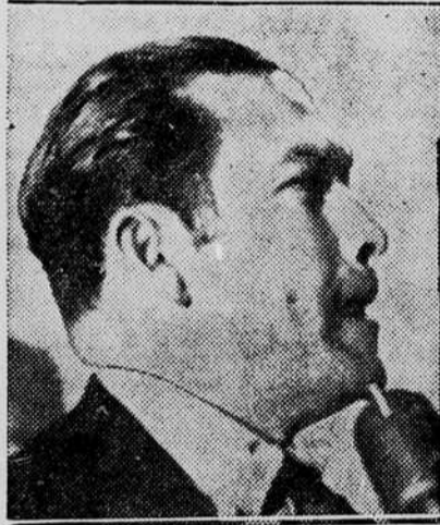
Forceful Fulgencio Batista, former head of the Cuban army is pictured in the midst of his first campaign speech in Havana, recently. He resigned from his army post to seek the presidency of Cuba.

The move will only slightly affect the location, so far as patrons are concerned, as they will continue to use the same stairway to reach the studio, the only difference being to turn to the right, instead of the left, at the head of the stairway.