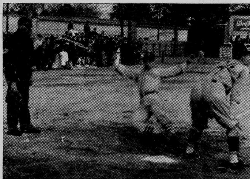
At top, Lefty Tommy Byrne, ace Wake Forest pitcher and former Roanoke Rapids Owl, is shown scoring after cleaning the bases in the fatal 9th here last Saturday when Wake Forest beat Duke before a chilled but enthusiastic crowd of over 1,000. At bottom is the first score of the game, a regular Big 5 match.