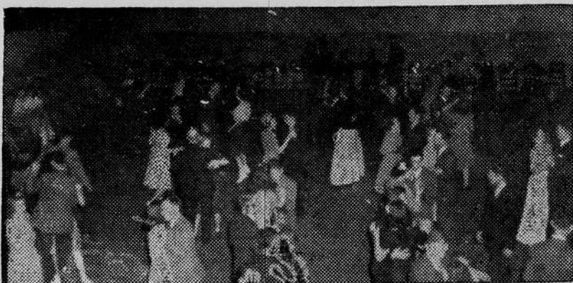
Above is a view of the dance given by the Kiwanis Club in honor of the members of the minstrel cast. The function was held in the gymnasium of the high school.