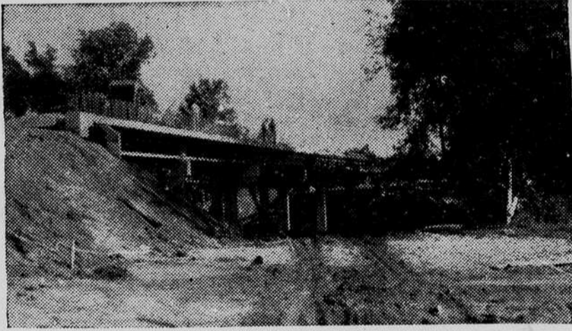
The beautiful new bridge on the new section of highway between the river and Gaston begins to take form after several weeks' construction. Picture reveals the excavation work near the bridge for the construction of the big fill across the river bottom.