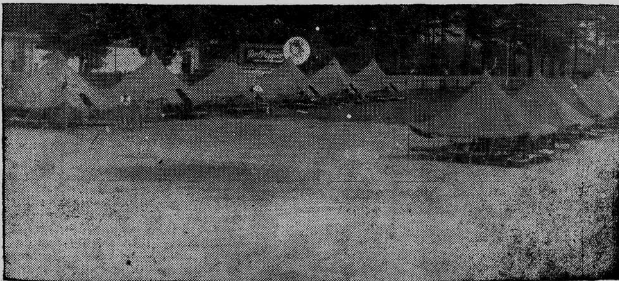
Above is pictured "Camp Simmons", headquarters for Company B of the 105th Medical Regiment of the North Carolina National Guard. The scene of many a hot baseball contest, Simmons Park is now serving as a camp for 66 soldiers and their commander—men who are doing their bit in the giant defense program underway by Uncle Sam.