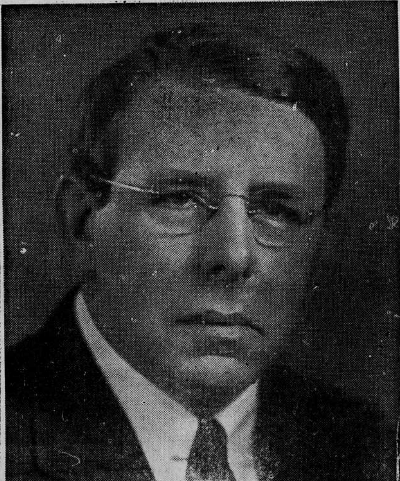
Governor-nominate J. M. BROUGHTON of Raleigh will be a guest in Roanoke Rapids this Friday and will join in the ceremonies honoring Company B, 105th Regiment, in the dedication of the site for the new Roanoke Rapids Armory and in the informal opening of the Roanoke Rapids Country Club.