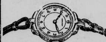
FELICIA—17 jewels, 10K gold-filled . . . $40.00

THE one way to be sure you'll have the watch you've always wanted — is to buy it yourself. See our complete selection today.