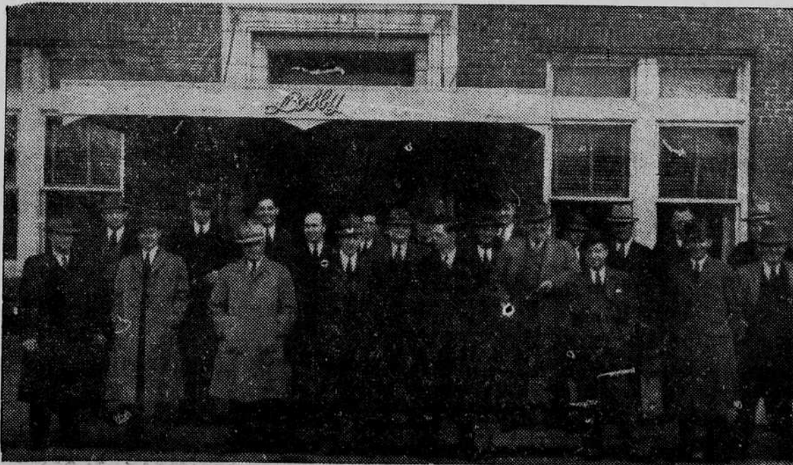
Part of the fifty deer hunters from Roanoke Mills Co. and Patterson Mills Co. who spent an enjoyable and profitable hunt near Raeford last week-end. Details inside.