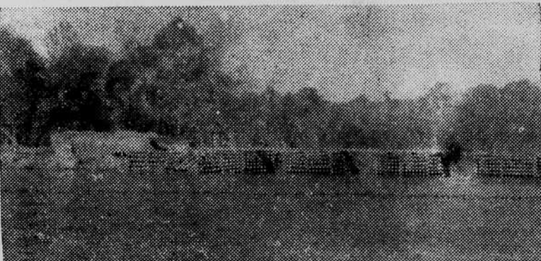
Above are two scenes of the construction going on at Ivey Island where the Power Company is preparing to have a big concrete dam built across the channel that was washed out of the island during the August flood. Top picture shows ferry used to transport rock, lumber, mules, machinery from mainland to Island. At bottom is view of the log cribs strung out across the channel. These cribs will serve as bulwarks of the coffer dam.