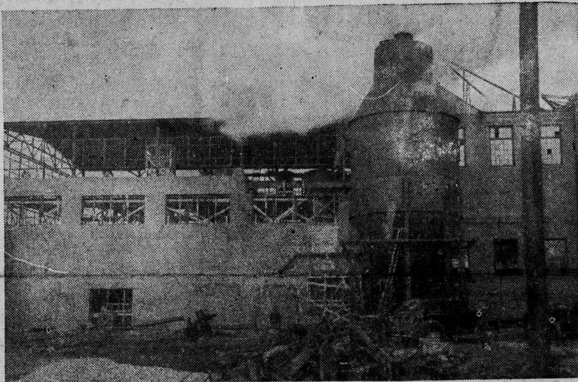
Above photograph shows construction work in progress on the new addition at the Halifax Paper Company. This three-story addition will be over 50 per cent larger than the section, on the same location, that collapsed during the August flood.