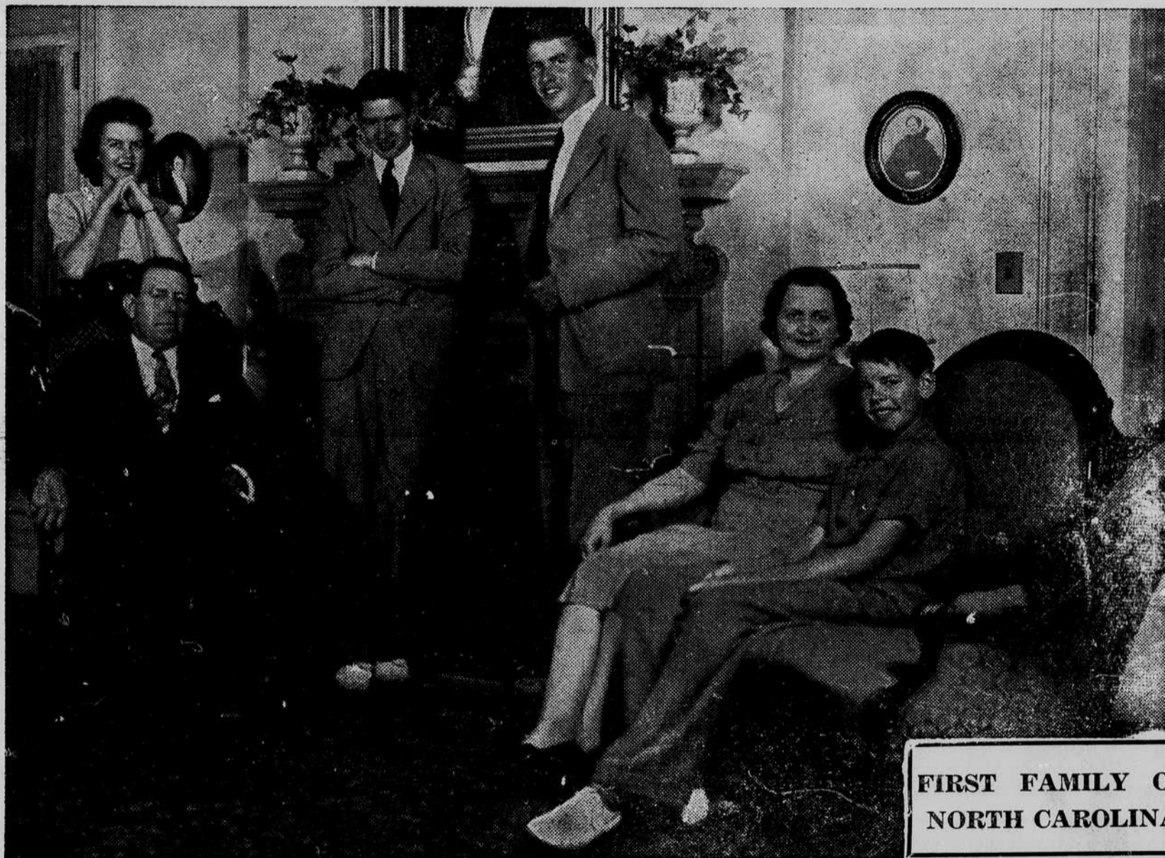
FIRST FAMILY OF NORTH CAROLINA