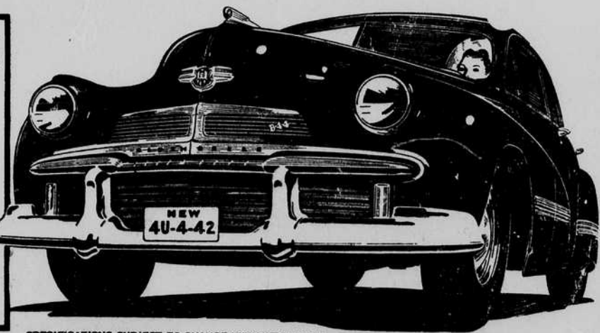
SPECIFICATIONS SUBJECT TO CHANGE WITHOUT NOTICE

1. Sidewalls are extremely durable, without unnecessary thickness. 2. Reinforcement ribs prevent distortion. 3. Electroplated surfaces protect against scoring. 4. Four piston rings provide better compression and improve oil economy.