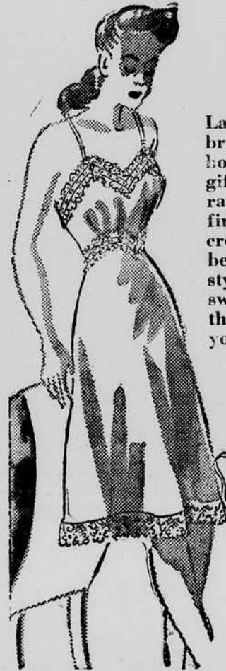
Give Her Several CYNTHIA* SLIPS