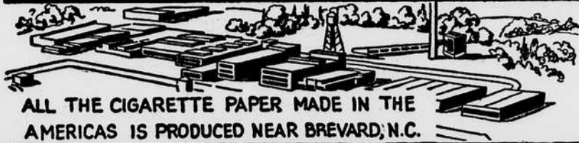
ALL THE CIGARETTE PAPER MADE IN THE AMERICAS IS PRODUCED NEAR BREVARD, N.C.