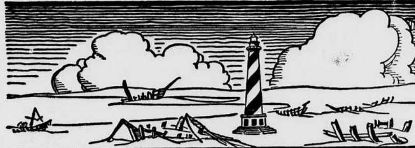
WITHIN 125 YARDS OF ABANDONED CAPE HATTERAS LIGHTHOUSE, N.C., LIE 15 OR MORE SHIP SKELETONS. HATTERAS WATERS ARE CALLED "THE GRAVEYARD OF THE ATLANTIC"

IN 1941, NORTH CAROLINA'S BEER INDUSTRY PAID $2,111,000 IN TAXES TO THE STATE!