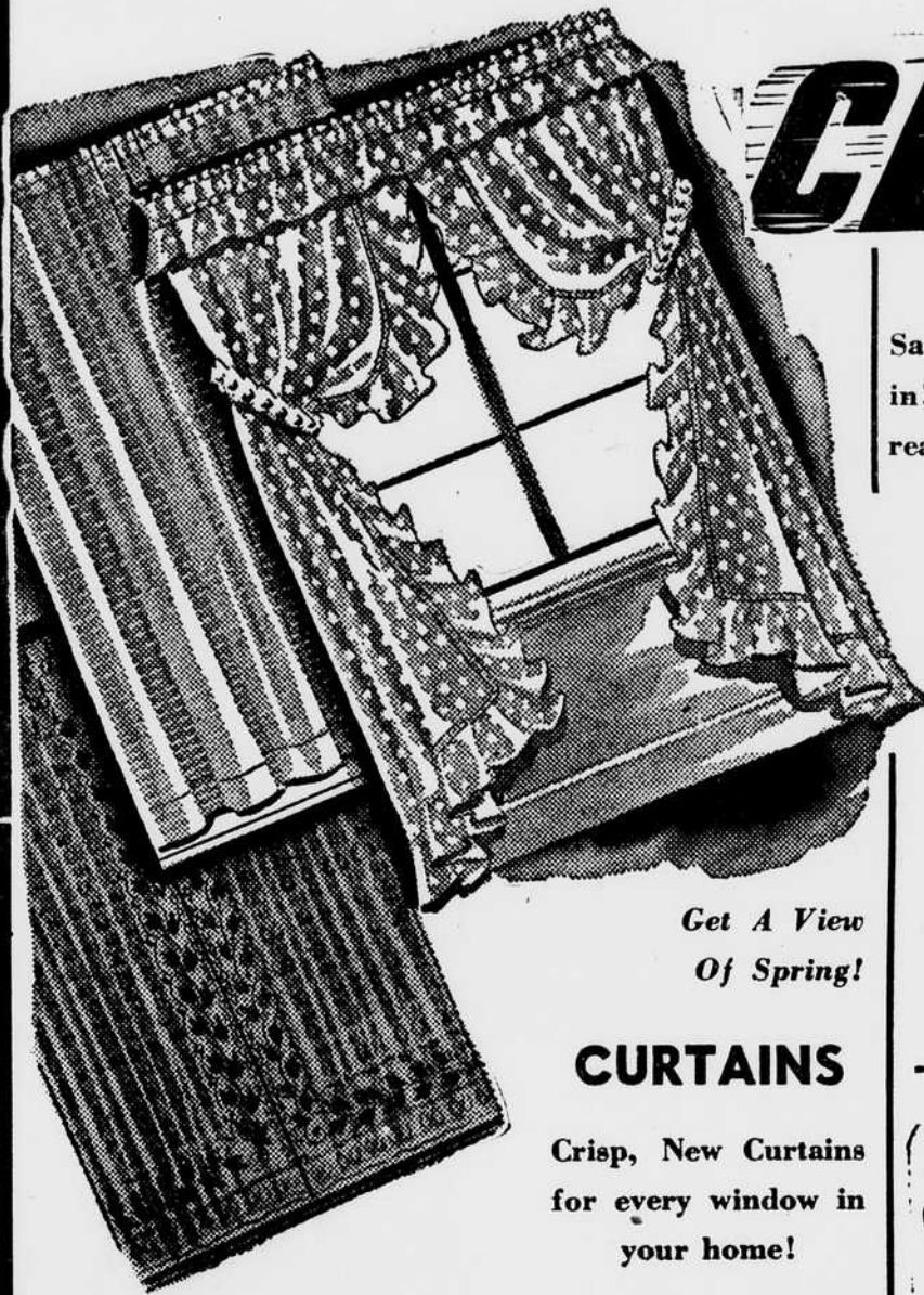
Get A View Of Spring!