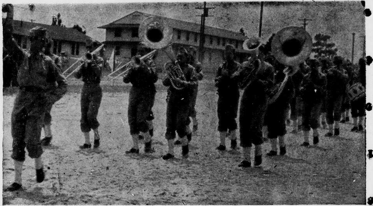
Passing in review before a group of Ft. Bragg officers and dignitaries including Gov. J. Melville Broughton is this file of North Carolina State Guardsmen led by the State Guard band during last July's 10-day encampment at the huge training post. The State Guard will return to Ft. Bragg this July for another training period.