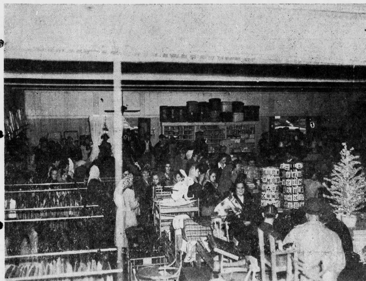
Picture above shows the eagerness with which women, and men, too, visited Proctor's Department Store recently to buy the precious Nylon hose put on sale for one day. Over 5000 pairs were sold during the day.