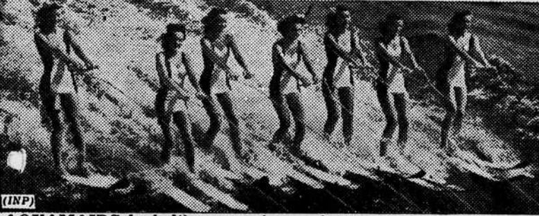
AQUAMAIDS look like sea-going rockettes as they practice off the Florida coast. They're rehearsing for water rodeo.