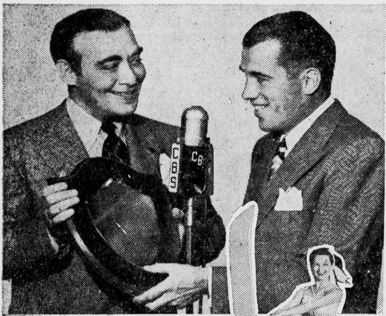
BAKER CITED FOR SERVICE —A silver plaque, symbolizing "distinguished wartime entertainment service," is presented to Phil Baker (left), Ever-sharp "Take It Or Leave It" Quizmaster, by Ed Sullivan, newspaper columnist. Baker became M.C. of the writing and shaving instrument company's $64 quiz show in 1941.