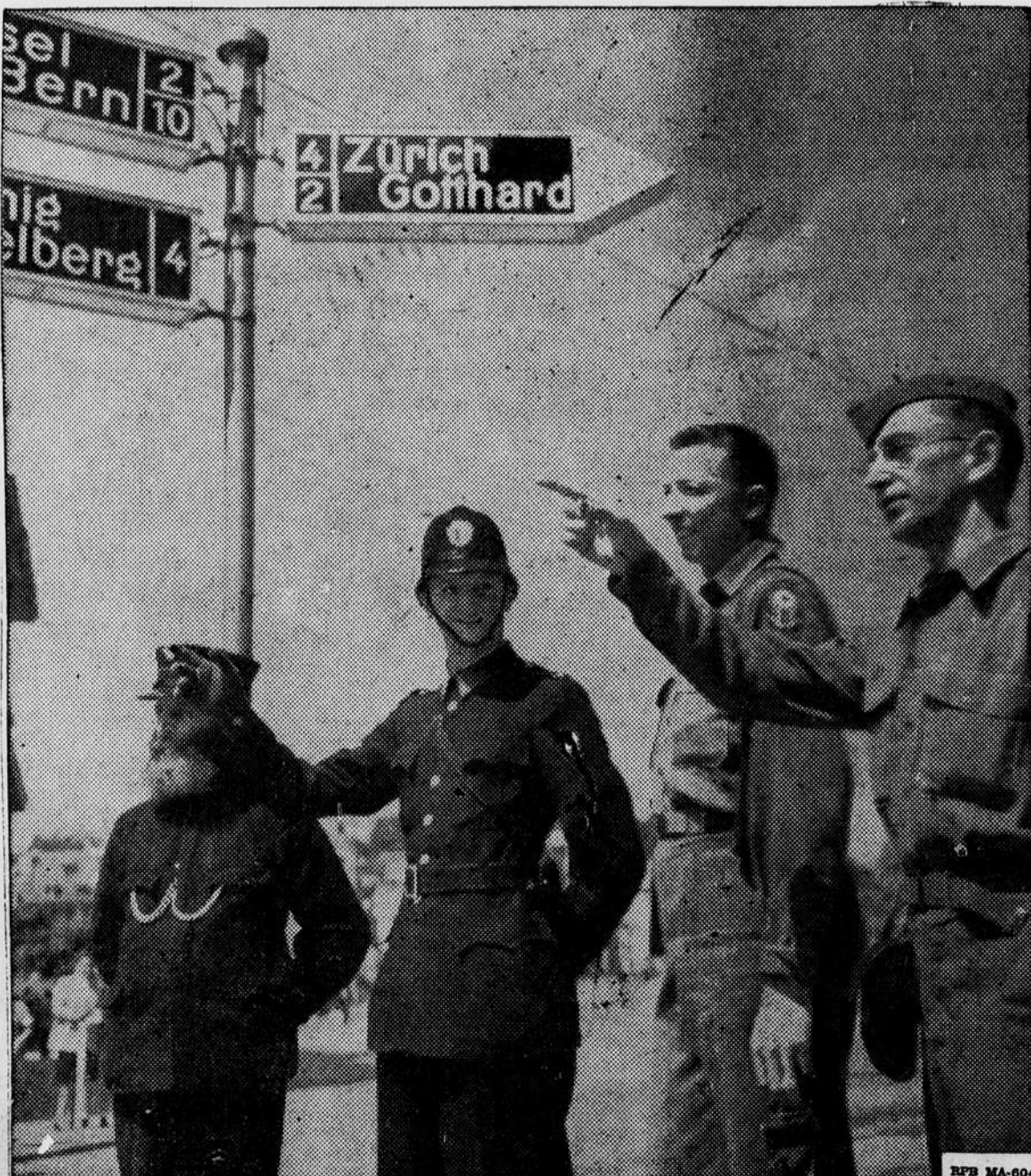
It wasn't so difficult asking directions in Lucerne, Switzerland, as was anticipated by these Army Regulars, on pass from their occupation duties in Germany, because they learned that most Swiss people speak English. For young men between 18 and 34 years of age, inclusive, who seek travel, adventure, recreation, and comradeship, the Regular Army offers many inducements.

Published through the Courtesy of Taylor's Drug Store.