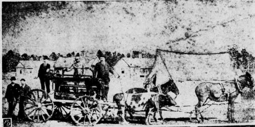
The above rare photograph, taken in 1896, shows a team of two mules and an ox hauling a new loom to a South Carolina mill from the nearest railroad point. Transportation was a big problem faced by southern mills in obtaining new machinery during the 19th Century. On the right, this latest high speed loom on which the shuttle travels across the cloth more than 220 times per minute, emphasizes the high-speed era of today in which streamlined transportation goes hand in hand with top-speed, easily-operated textile production machinery.