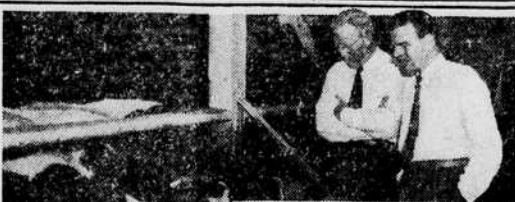
FARMER DEWEY explains some of the finer points of dairy cow husbandry to Republican vice presidential nominee Earl Warren during the California Governor's visit to Dewey's Pawling, N.Y., farm.