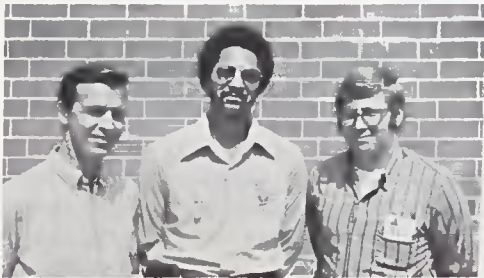
Bowling's big "3"—President, VP, Secretary-Treasurer.