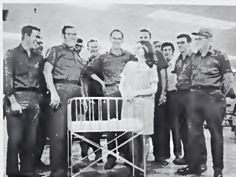
Super Baby Bassinet