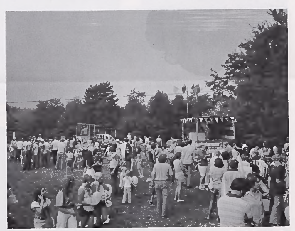
Everybody at the Annual Picnic having fun