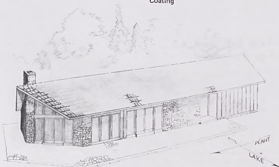
Artist's sketch of Visitor Center