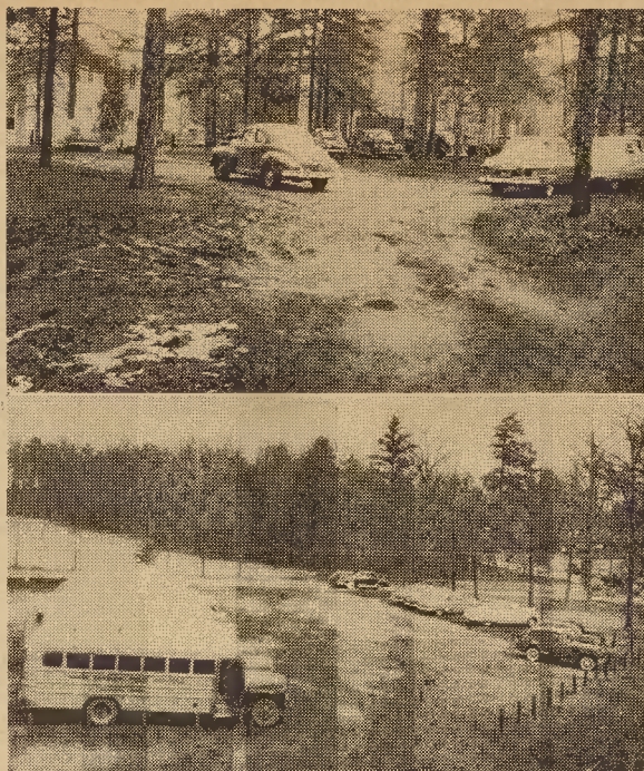
Pictured above are the two main parking lots here at our institution. The top picture shows the students' or commoners' parking lot. The bottom picture is that of the teachers'. When asked for improvements on the top parking lot, the answer was: the maintenance corp is to take care of that. Therefore, the assumption is that the lower parking lot is also maintained in a similar fashion. Notice, however, how the tax payers money is applied to the various caste parking holes.

Address 502 Guilford Bldg. — Agent — W. A. Gourley Phones: Office 4-3261 Home 2-4504