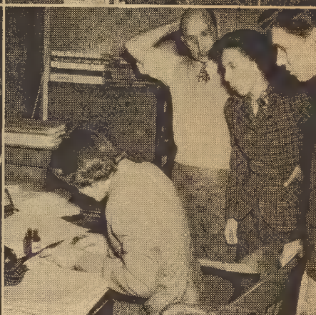
Members of the Whirligig are shown during a recent visit to the printers in Charlotte. In the upper left, the group is shown just arriving, and a printer explains the art to the group; upper right shows the group inspecting the press working. Lower left they are doing final proof reading; and in lower right they are signing out.