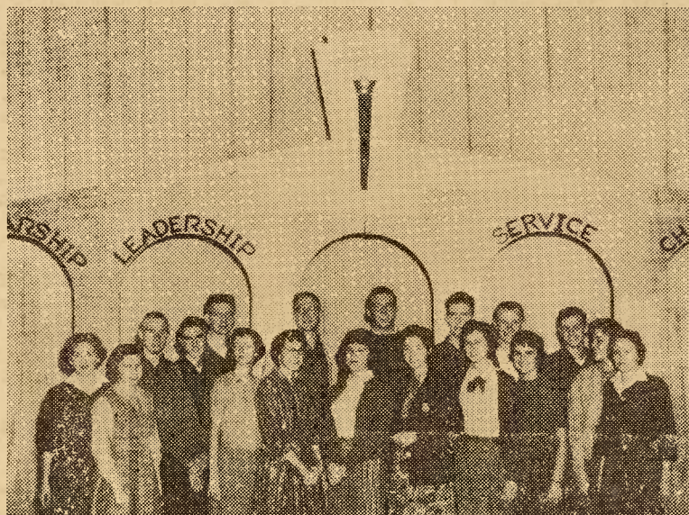
These are the sixteen seniors recently inducted into the National Honor Society at GHS.