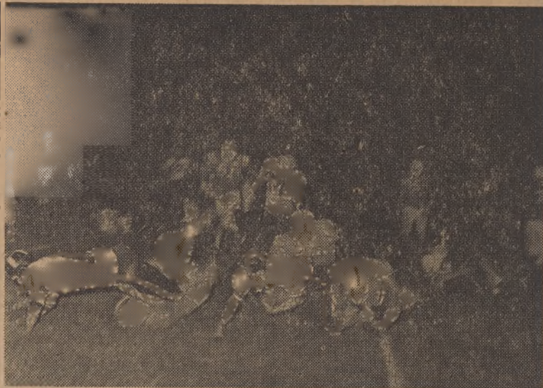
This tangle soon straightened itself out in the Page contest as the Whirlies came out on top 26-6 over the rival Pirates.