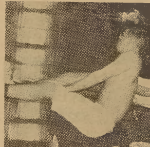
Unusual activities can be seen on the basketball court of the Boys' Gym. The pros exhibit their excellent co-ordination.