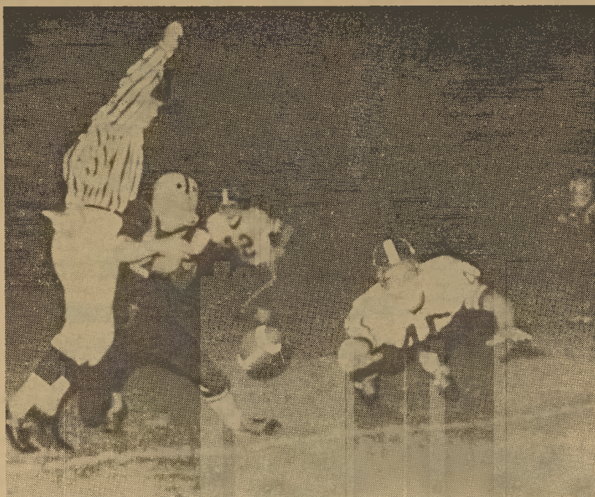
The 1964 Whirlies completed their football season with a game with their cross-town rivals last Friday. The Whirlies final record for the '64 season is 7-3. (prediction)