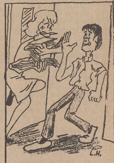
GIRLS! Your day is approaching!