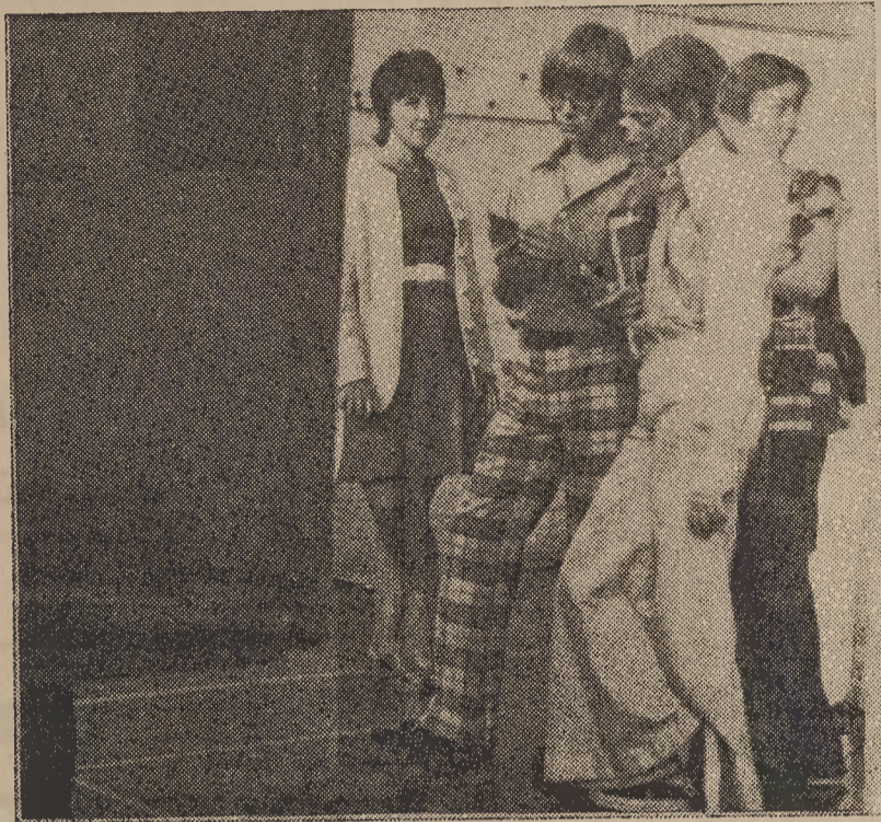
Seniors stand in long line to vote.