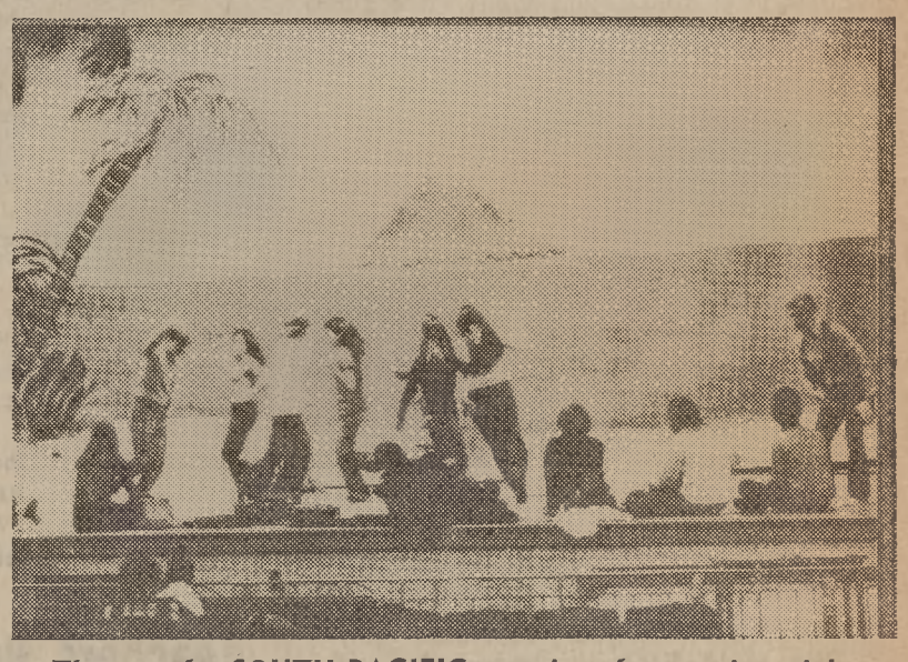
The cast for SOUTH PACIFIC practices for opening night.

Two pairs of tickets will be given, away free in a drawing courtesy of South Pacific. See Page 4 "or coupon and further detaails pertaining to the free drawing.