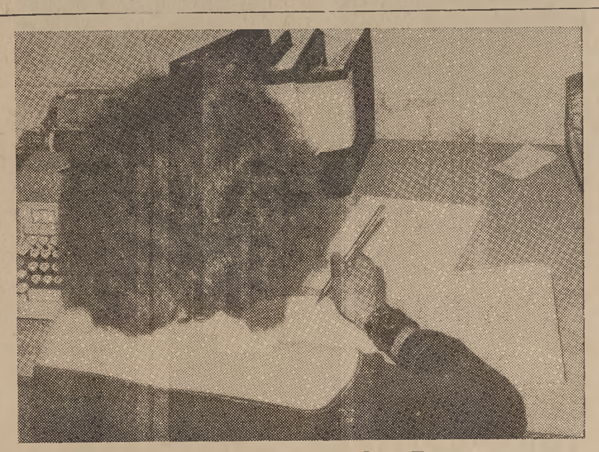
Sophomore Failing Scat-Step Tests.

Patience on the part of Juniors and Seniors has not gone unnoticed. For their co-operation PSAT and College Board Exams